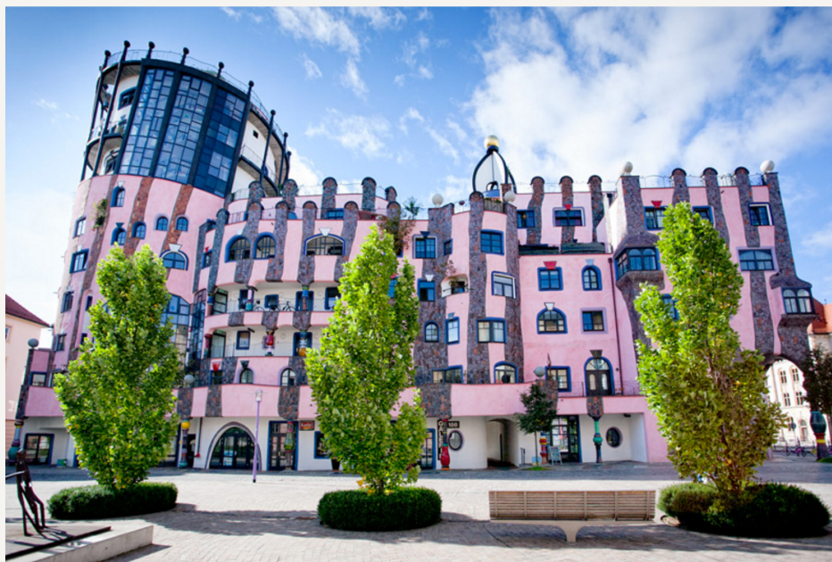
Green Citadel of Magdeburg, designed by the artist F. Hundertwasser

The Call for Papers as well as the Online-Registration are open. The Congress programme will be available in spring 2016.